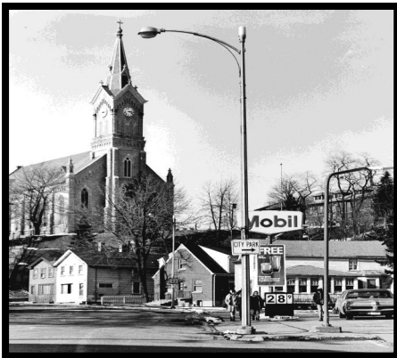
Dee Bee's Mobil

near the curbs. The fuel was poured into the gas tank of the automobile using a funnel. This was quite dangerous. After a series of fires and explosions, regulations forced businesses selling gasoline to be moved from city centers to