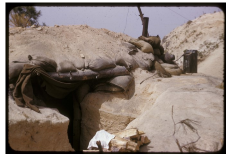
Roy's underground bunker

carpenter who worked his trade in the late 1880s into the early 1900s. His toolbox contained many tools of the trade, including braces, bits, planes, saws, wood folding tape measures, a wood level,