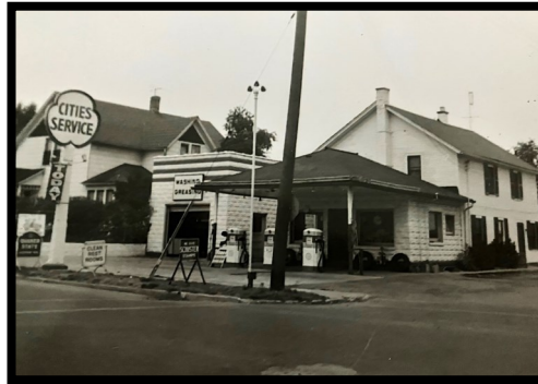
Ted's Cities Service