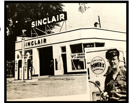
Sinclair Service Station