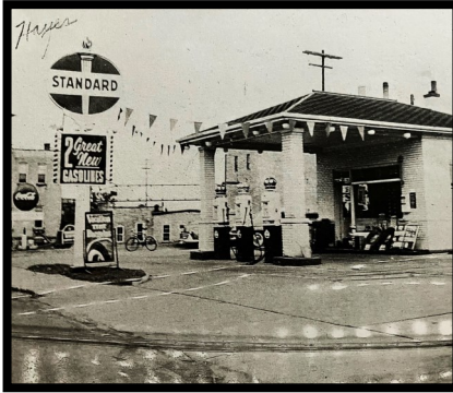
Standard Service Station

Before gas stations existed, motorists bought gasoline from hardware stores, general stores, pharmacies, blacksmiths, etc. The fuel was available in five-gallon cans which were stacked