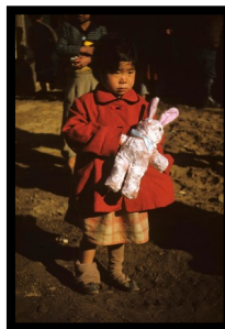
Girl with Christmas present