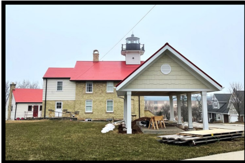
Boat shelter before the final cleanup

Thanks to Fine Line Carpentry for recently completing the open design exhibit and protective shelter for the restored lifeboat from the shipwreck rail car ferry SS Milwaukee . Construction began late last fall and was completed in March. There's still landscaping to do once it warms up.