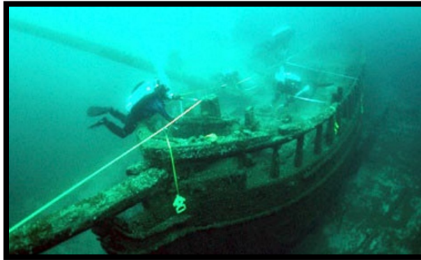
Wreck of the schooner Northerner