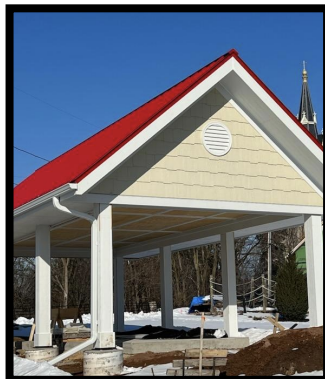
The beautiful red roof accentuates the boat shelter