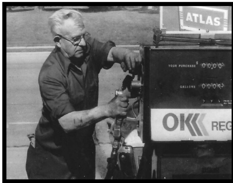
Peiffer Auto Service